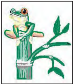
.gif @ 400%

AVOIDING ADDITIONAL COSTS Files obtained from the Internet (.jpg or .gif) or artwork created in MS Office applications (Word, PowerPoint, Publisher, Excel, etc.) are not suitable for high quality output, and require additional hourly charges. Artwork should be created in a design program at 50-100% of actual size. If you have very large files please contact us for options. To avoid additional costs, please send files using the guidelines below.