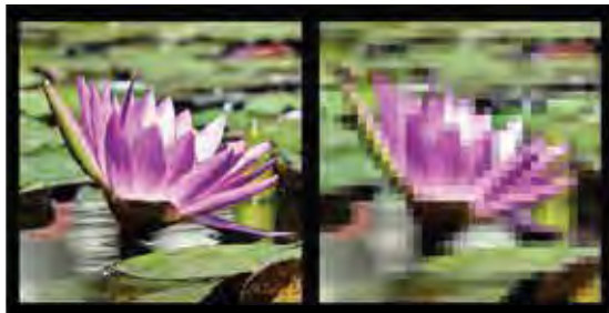
High Resolution (300 dpi)

* All fonts within the artwork need to be converted to outlines.